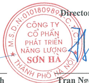
Tran Ngoc Hung