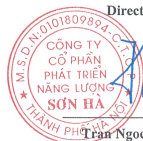
Tran Ngoc Hung