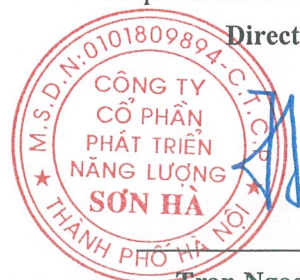
Tran Ngoc Hung